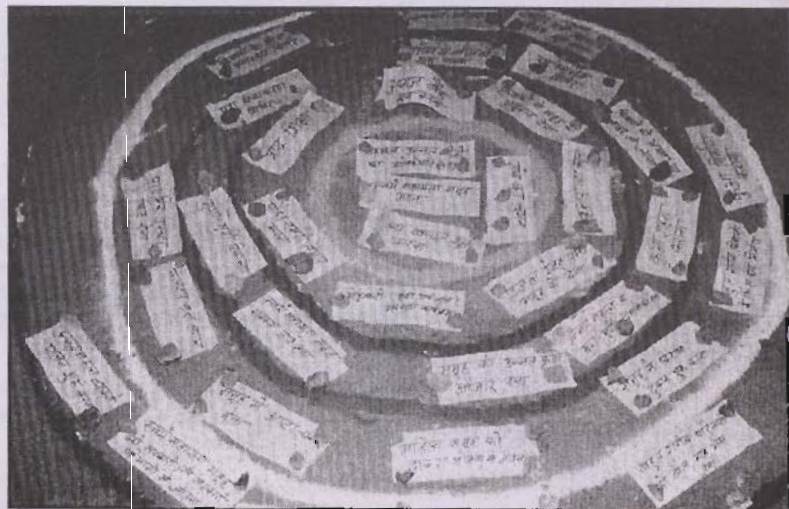
Prioritisation of Village problems in a village work plan which are to be taken on yearly basis. Each circle indicates an year.

The work plan is a calendar of activities intended to be undertaken during a set period. It is to be developed jointly by the community and the project. The Village Work Plan highlights resource planning, contributions in costs and responsibility sharing.