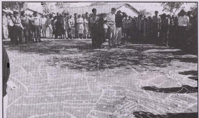
A Village Social Map.