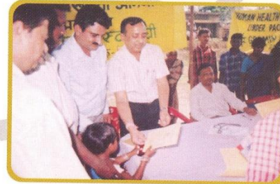
Inauguration of Health Camp