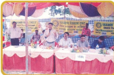
Crop Management Training Programme