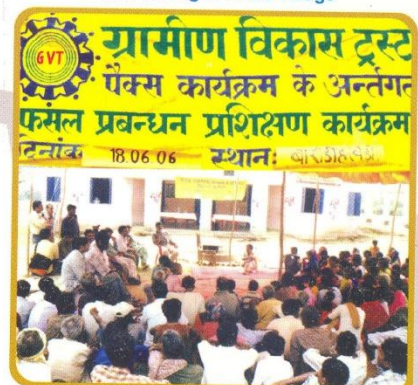
Crop Management Training Programme