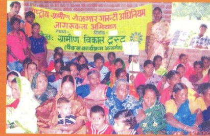
An awareness rally and meeting for NREGA