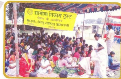
Mother & Child Health Awareness Campaign