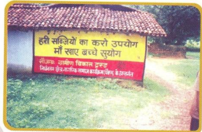
Wall writing in PACS village