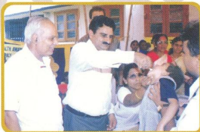
Catch-up round of Government