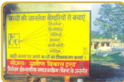
Wall writing in PACS village